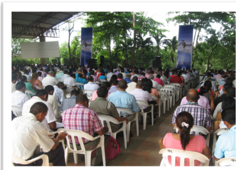
Delegates at 70th Anniversary