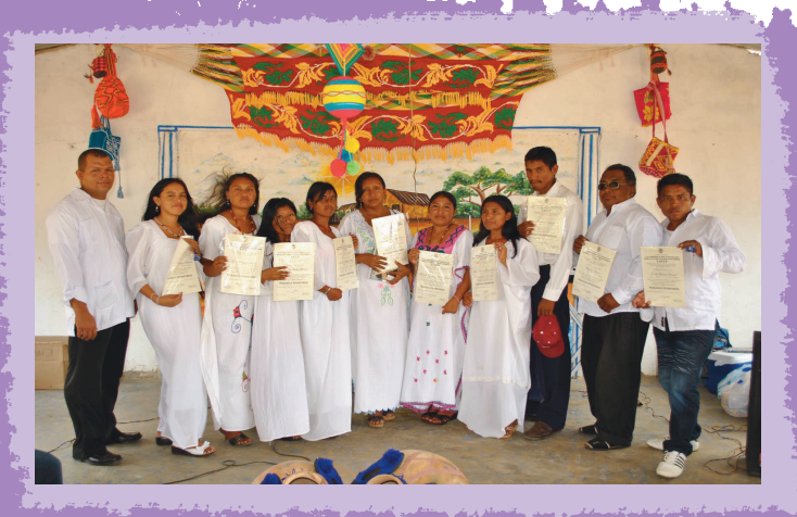
The first group of Wayuu pastor and leader graduates.