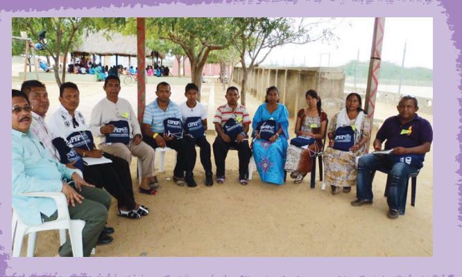
Maximu students of CIDED with Poster Libelde E

The Wayuu dialect is basically an oral language. So they use the Spanish study materials for their written work but, in their group meetings, prefer to discuss the lessons in their native tongue!