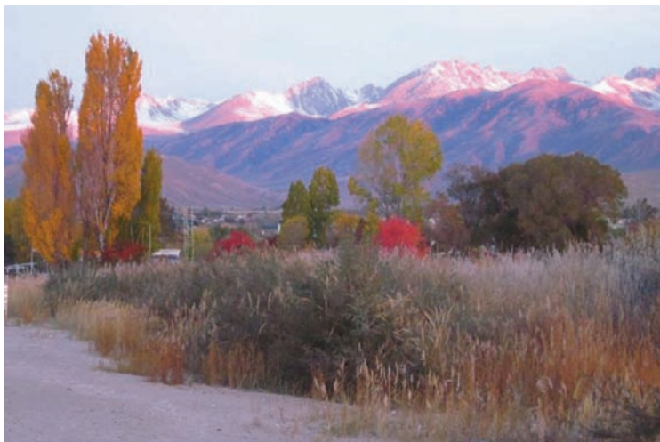
Autumn at Issyk-Kul, Kyrgyzstan.

SEAN continues to spread across the churches in Central Asian countries that were once part of the USSR. In that region there is a big need in both basic theological education and training of church leaders "on the field". The number of new Christians continues to grow there, especially amongst the ethnic people, while the migration out of that region affects the number of trained church leaders. SEAN seems to be just the tool to equip and empower the new believers and strengthen the churches in Central Asia who experience continuous persecution and economic hardships