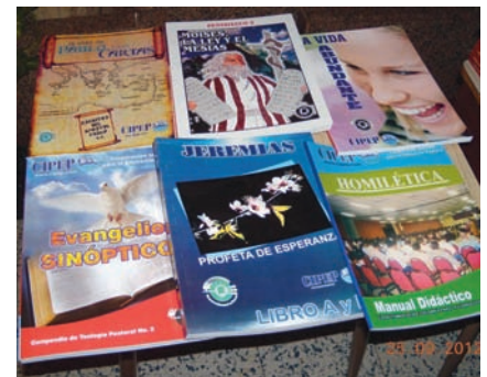
Display of various course books (CIPEP, Colombia)