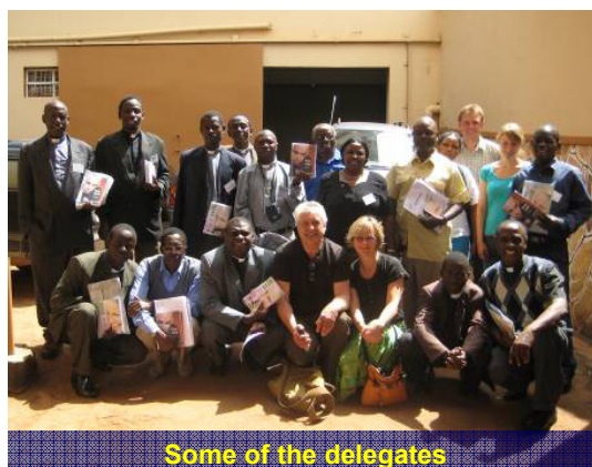
Some of the delegates

Countries where SEAN Courses are in use: (some are not named for security reasons)