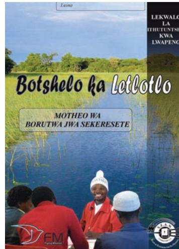
Life to the Full in the Setswana language

Students must have completed all the lessons in their Home Study Workbooks.