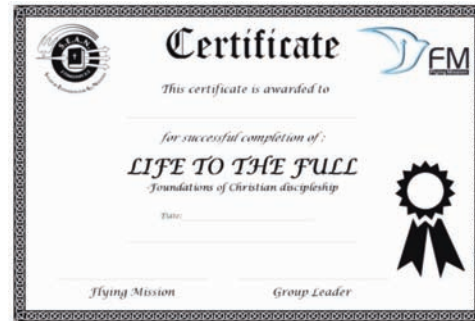
A sample of the certificate awarded upon successful completion of the course.

Certificates are usually presented during the church's main meeting, which recognises those completing the course and promotes it to others. This can also be a good time for the graduates to give a brief testimony of what God has done in their lives through doing the course.