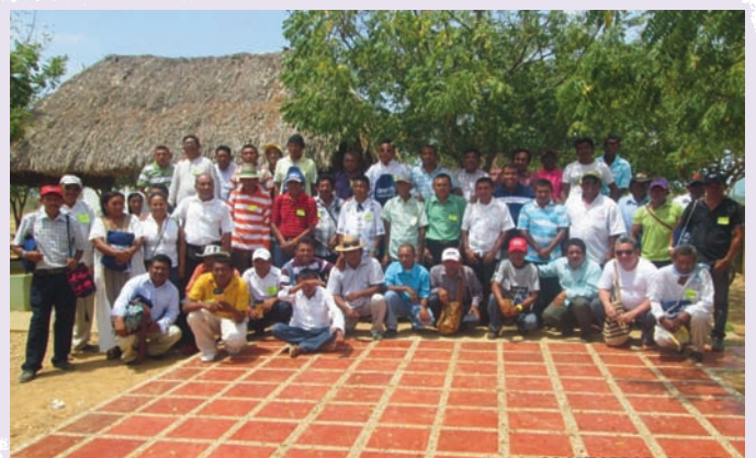
Wayuu pastors who participated in the Congress at which a Wayuu pastoral association was formed.

The goal is to see 100 Wayuu pastors complete 4 years of study and graduate, by the end of 2014.