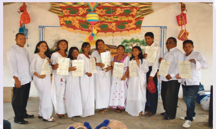
The first group of Wayuu pastor and leader graduates.