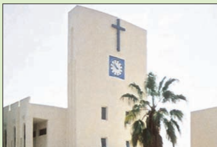
The NEC, Bahrain.