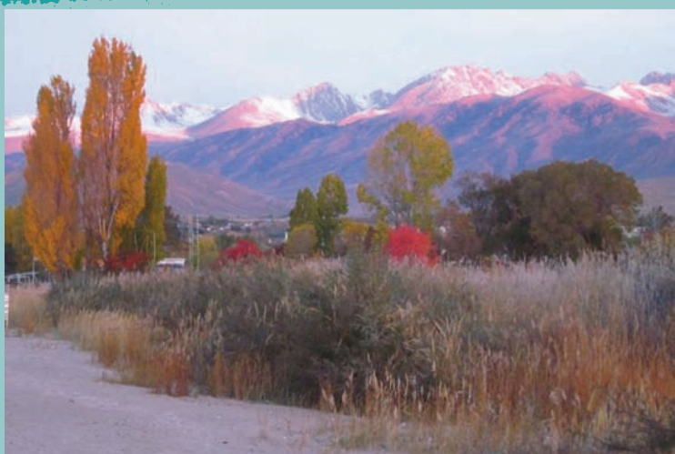
Autumn at Issyk-Kul, Kyrgyzstan.

SEAN continues to spread across the churches in Central Asian countries that were once part of the USSR. In that region there is a big need in both basic theological education and training of church leaders "on the field". The number of new Christians continues to grow there, especially amongst the ethnic people, while the migration out of that region affects the number of trained church leaders. SEAN seems to be just the tool to equip and empower the new believers and strengthen the churches in Central Asia who experience continuous persecution and economic hardships