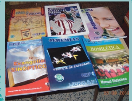
Display of various course books (CIPEP, Colombia)